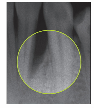
Before Emdogain treatment