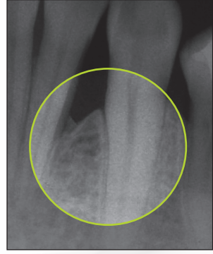
Bone and tooth attachment have been regenerated with Emdogain

*In combination with surgical procedures