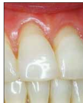
Before Emdogain treatment