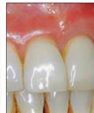
After Emdogain treatment

Similar to stem cells, Emdogain regenerates lost tissue and bone, and reverses the effects of recession.