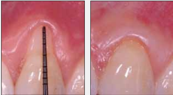
Before Emdogain treatment